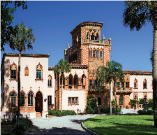
Sarasota High School Addition