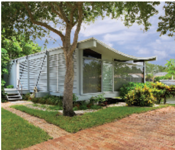
Healy Guest House (Cocoon House)

Please make sure to respect buildings noted as “not open to the public,” which means they are private property and to be viewed ONLY from the right of way. Do not trespass, knock on doors, or ring doorbells at private residences. An entry fee is charged for some of the buildings that are “open to the public.”